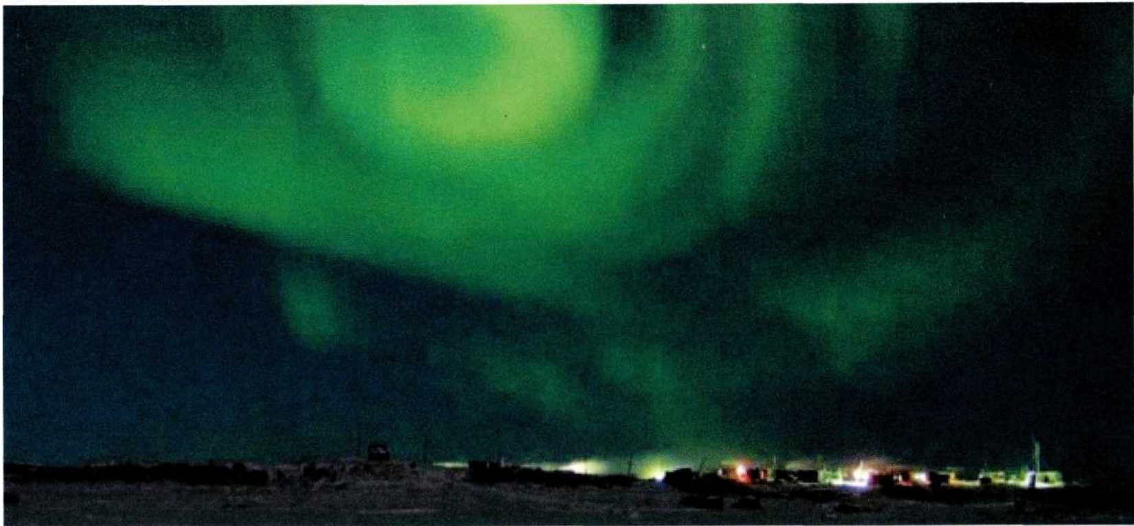
Vankor oil and gas field, Siberia, under a northern sky