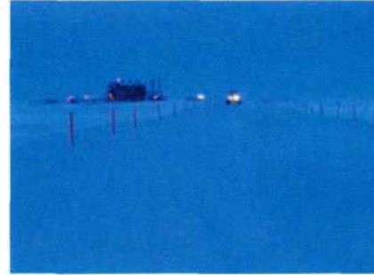
Ice roads serve as ephemeral transport links to remote drill sites during the dark days and nights of Arctic winter.

Crews in the Arctic often battle the most severe weather conditions on the planet.